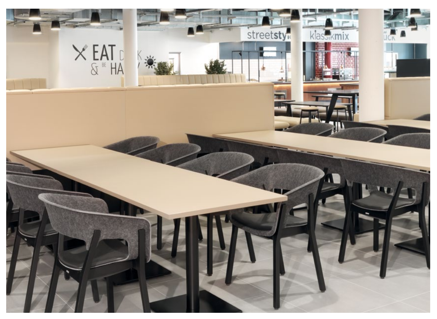
Aramark GmbH Refreshment Services, Gerlingen