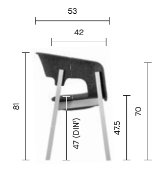
Weight: 5.0 kg