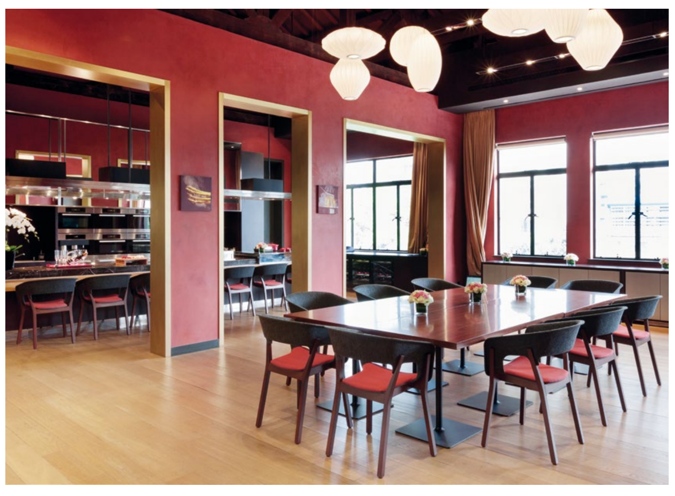
Miele House, Shanghai