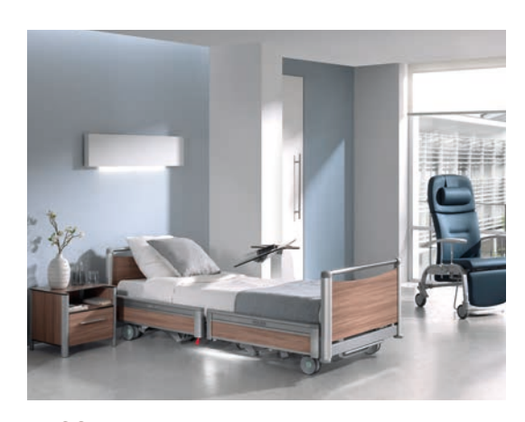
LAGO Safety and comfort

The Olympia hospital bed: tested, durable and safe. An utmost stable high/low adjustment by means of supporting arms combined with a highly functional design make this bed an all-rounder.