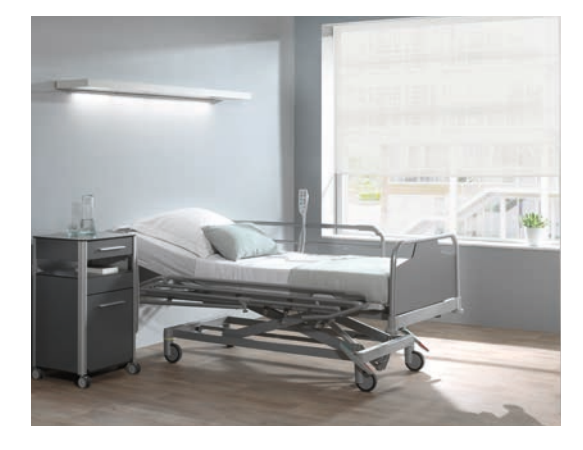
ARTENA Elegant certainty

Safety and comfort go hand in hand with the Lago bed. A low bed position of \pm 25 cm reduces the risk of falling, whereas the ergonomic working height of \pm 80 cm guarantees efficient care.